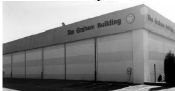
Jim Graham Bldg at the North Carolina State Fairgrounds

Overnight camping and full RV hookup available. Contact Fairgrounds Public Safety at 919-612-6767 upon arrival. $35 per 24 hours hookup fee paid to fairgrounds.